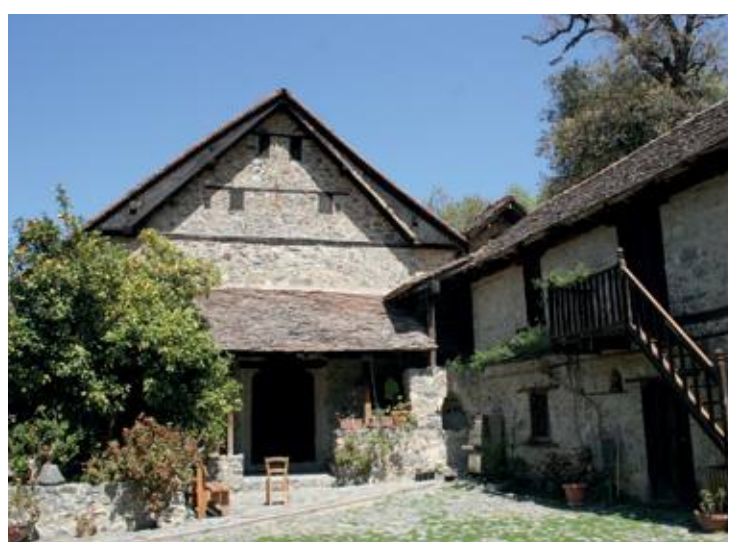
To discover more locations please visit the website http://film.investcyprus.org.cy/